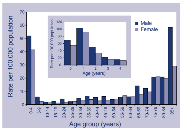
Figure 2. Notification rates of invasive pneumococcal disease, Australia, 2001, by age and sex

In Australia in 2001, IPD was largely a disease of the very young and very old. The highest rates of disease were among children aged less than 5 years (47.3 cases per 100,000 population) and adults aged more than 85 years (38.7 cases per 100,000 population, Figure 2). Among children aged less than 5 years, the highest rates of disease were in those aged 12 months (males 103 and female 91 cases per 100,000 population). Overall, there were more male cases and there was a male to female ratio of 1.2:1.