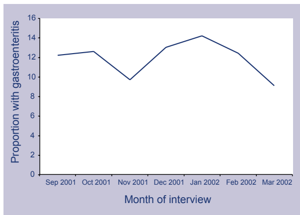
Figure 2. Unweighted results of the national OzFoodNet gastroenteritis survey showing the proportion of respondents reporting an episode of gastroenteritis in the previous month (n = 3,916), September 2001 to March 2002

The data collected in this survey will contribute to OzFoodNet's calculation of an estimate of the proportion of gastroenteritis due to food. During the quarter, OzFoodNet held discussions with international programs researching gastrointestinal disease and agreed to compare survey date and findings.