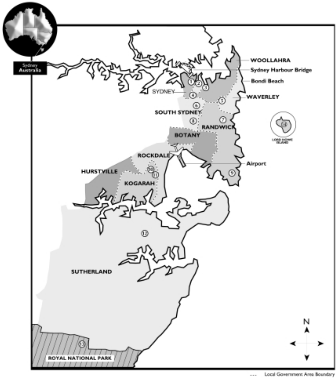
Figure 2. South East Sydney Health Service Area