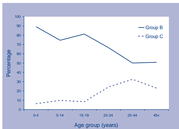
Figure 2. Serogroup B and C meningococcal disease as a percentage of cases of invasive meningococcal disease confirmed by all methods, Australia, 2005, by age group

In 2005, serogroup B meningococci predominated in all age groups in aggregated national data. Ninety-nine (90%) of the total of 110 laboratory-confirmed IMD cases in those aged less than four years were serogroup B and 6 (5.5%) were serogroup C. These figures differ little from 2004 data. In 2004, 97 (88%) of the total of 111 laboratory-confirmed IMD cases in those aged less than 4 years were serogroup B and 6 (5.5%) were serogroup C.