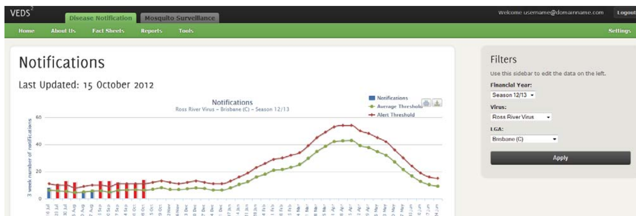
Figure 1: Reports page screen capture of the VEDS2 System

Each bar represents the number of notifications within the current 3 week moving window (3-week moving window finishes at end of the indicated week) and is colour coded according to whether it is above (red) or below (blue) the alert threshold. The green line is the expected number of notifications and the red line is the alert threshold.